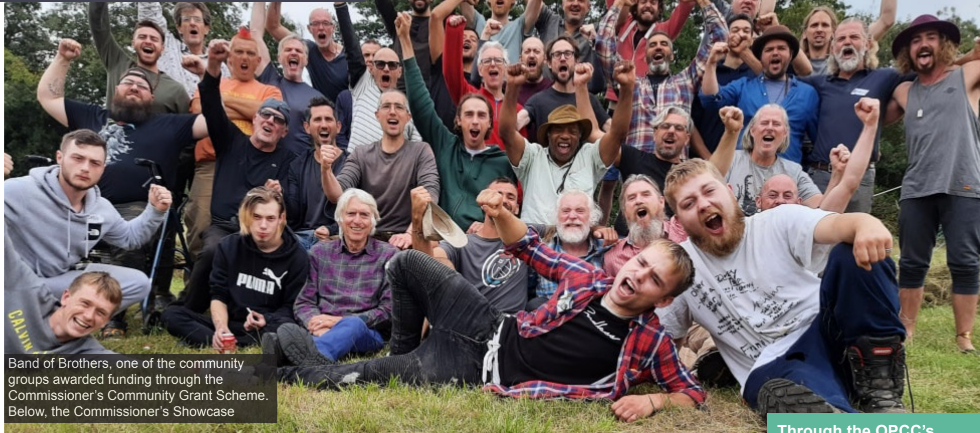
Band of Brothers, one of the community groups awarded funding through the Commissioner's Community Grant Scheme. Below, the Commissioner's Showcase

Successful bid to the Ministry of Justice for an additional £99,000 to